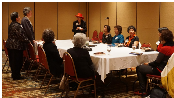
HWC Board awaiting arrival of Justice Sotomayor

We planned three events, starting with a private meeting with the HWC Board of Directors and Planning Committee members. At 4:00pm we gathered in a small room at the Embassy Suites Hotel to await Justice Sonia