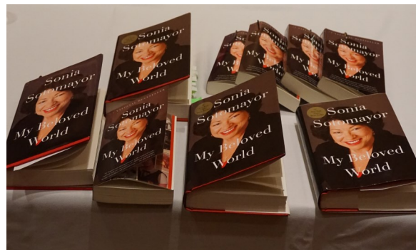
HWC members brought their personal copies of My Beloved World to be signed by Justice Sotomayor.

Time was allotted for Justice Sotomayor to take a break before the public event. The next time we saw her, she was being greeted joyously by 600 guests in the large ballroom.